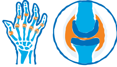
Rheumatoid Arthritis (RA)